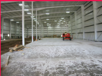
Poured concrete floor Pine River Saw Mill - Amasa, MI