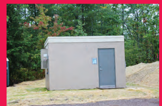
Eagle Mine Communications Building Big Bay, MI