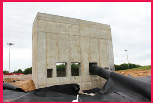
Leachate Vault At NewPage Mill Escanaba, MI