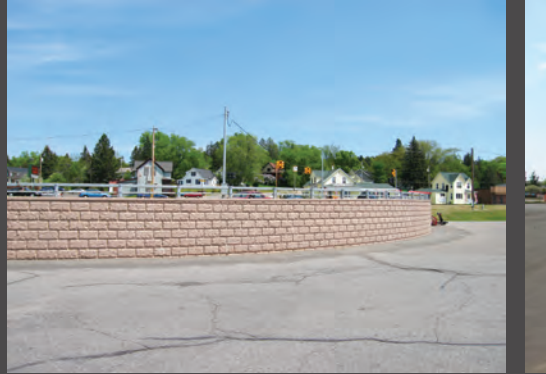
Super One Foods Retaining Wall Iron Mountain, MI

Pictures above show the Silver Lake basin splash wall formwork and finished product.