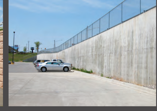
KFC Retaining Wall Iron Mountain, MI