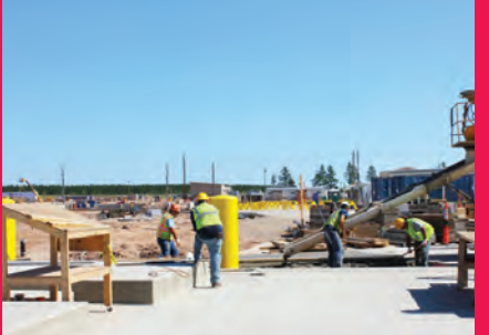
Concrete pavement and pouring of apron - Eagle Mine Site