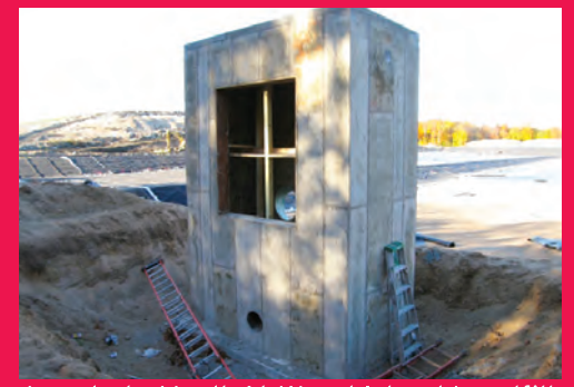
Leachate Vault At Wood Island Landfill Munising, MI